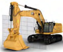
E-WALL CAB PROTECTION