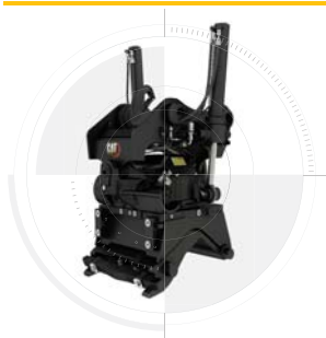
PIN GRABBER COUPLER*