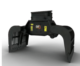
DEMO AND SORTING GRAPPLES