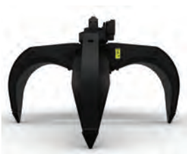
GSH – ORANGE PEEL GRAPPLES

Match your machine to the job. The MH3022 offers ten boom and stick combinations, while the MH3024 offers eight. The boom and stick options as well as multiple undercarriage configurations allow you to customize your machine to meet the demands of your application.