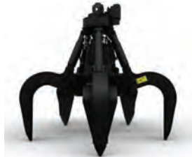
GSV – ORANGE PEEL GRAPPLES