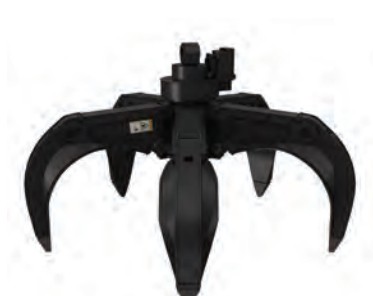
ORANGE PEEL GRAPPLES